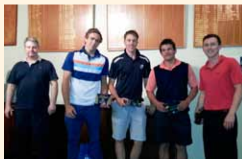
The runner ups.