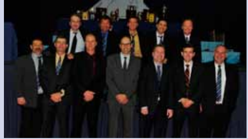
Class of 1983 at Old Boys dinner.