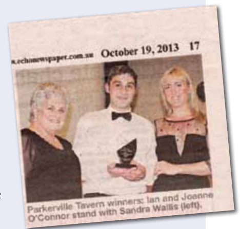
Thankyou too the Echo newspaper again